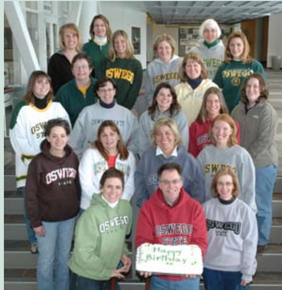
Alumni and Development staffers gathered on the steps of the new Campus Center to wish the Foundation a happy birthday.

To access the planned giving site, go to www.oswego.edu/giving and click on Gift Planning. ●