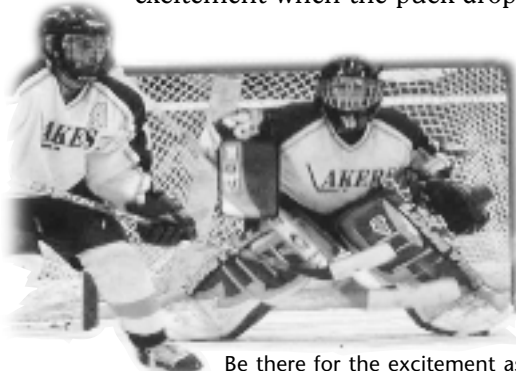
Be there for the excitement as the men and women Lakers kick off their seasons at the new Campus Center.

Visit Oswego on a weekend especially for you! Family and Friends Weekend is set this year for Oct. 20 to 22. Many activities are scheduled to showcase the academic, athletic and creative talents of Oswego students. Experience the excitement when the puck drops for the first time in our new