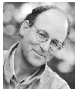
Tracy Kidder, author of Mountains Beyond Mountains , will speak on campus Oct. 30.